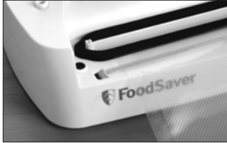
Place Bag on Sealing Strip